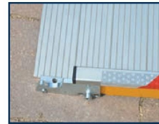
Hole for optional fixing