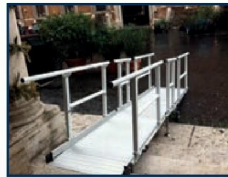
Optional Hand railing