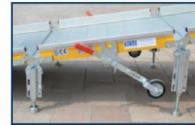
Handling system: 4 feet and 2 wheels