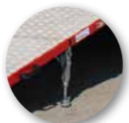
Self-positioning adjustable feet