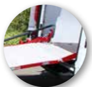
Mobile contact flap to connect to the floor of the van