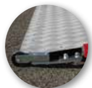
Wheel for assisted deployment