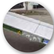
Safety edges (5 cm)