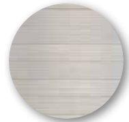
Aluminium anti-slip platform