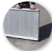
Four wheels and two handles for easy transport