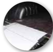
Adjustable floor contact flap