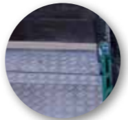
Mobile contact flap to connect to the floor of the van