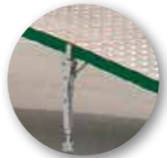
Self-positioning adjustable feet