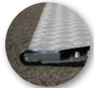
Wheel for assisted deployment