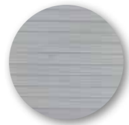
Anti-slip anodised aluminium platform