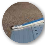
Two wheels for easy deployment