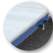
Safety edges (6 cm)