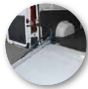
Flexible contact plate to the van floor